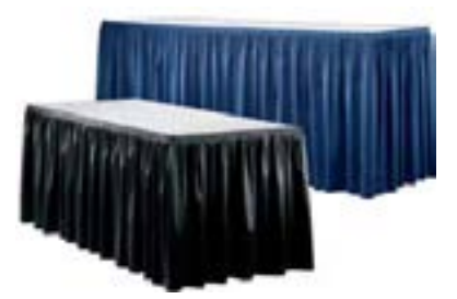
Table with Skirt

Show color will apply if no color is selected. Color availability is only guaranteed with pre-orders.